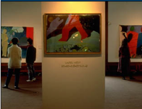
Mather Art Gallery, Thwing Center