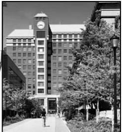
Biomedical Research Building Entrance