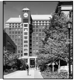
Biomedical Research Building